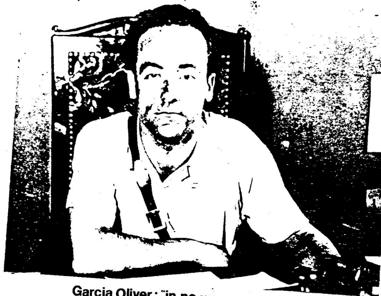
Garcia Oliver; "in no way prepared..."

The entry of the CNT to the Madrid government was not a very big surprise, nor was it an 'historic error' but a symptom of